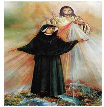
Jesus speaking to St. Faustina.

For more information on events please visit Friday Facts: At the Archdiocese of Ottawa page. www.CatholicOttawa.ca