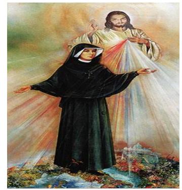
Jesus speaking to St. Faustina.

For more information on events please visit Friday Facts: At the Archdiocese of Ottawa page. www.CatholicOttawa.ca