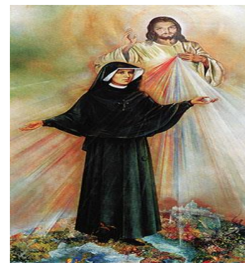
Jesus speaking to St. Faustina.

For more information on events please visit Friday Facts: At the Archdiocese of Ottawa page. www.CatholicOttawa.ca